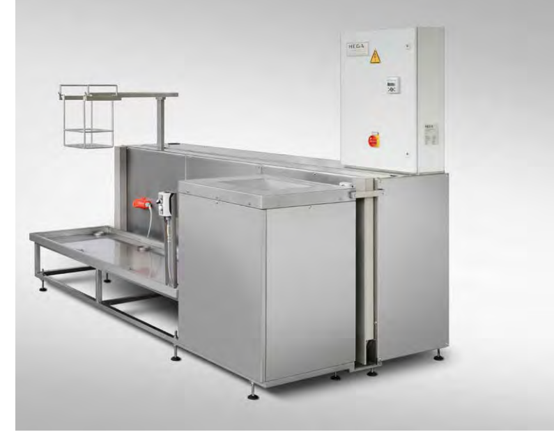
Converter with integrated dryer, without standard ultrasonic devices and mounted generators.

The converter consists of a level-adjusting rack for the standard devices and their generators – and when needed a dryer and/or a spill sump – as well as the actual converter including the controls. This guarantees fully automatic movement and conveying of goods through the baths.